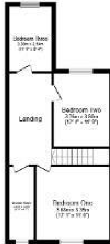
First Floor Floor area 48.8 sq.m. (526 sq.ft.)