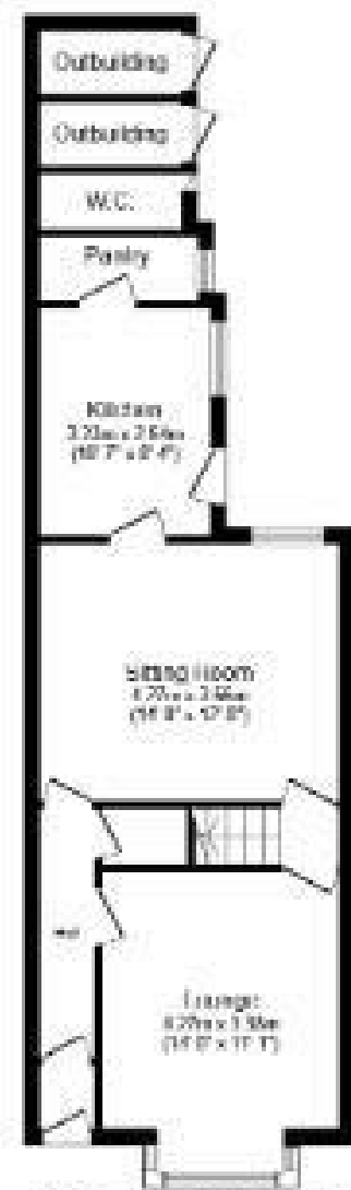
Ground Floor Floor area 52.9 sq.m. (569 sq.ft.)