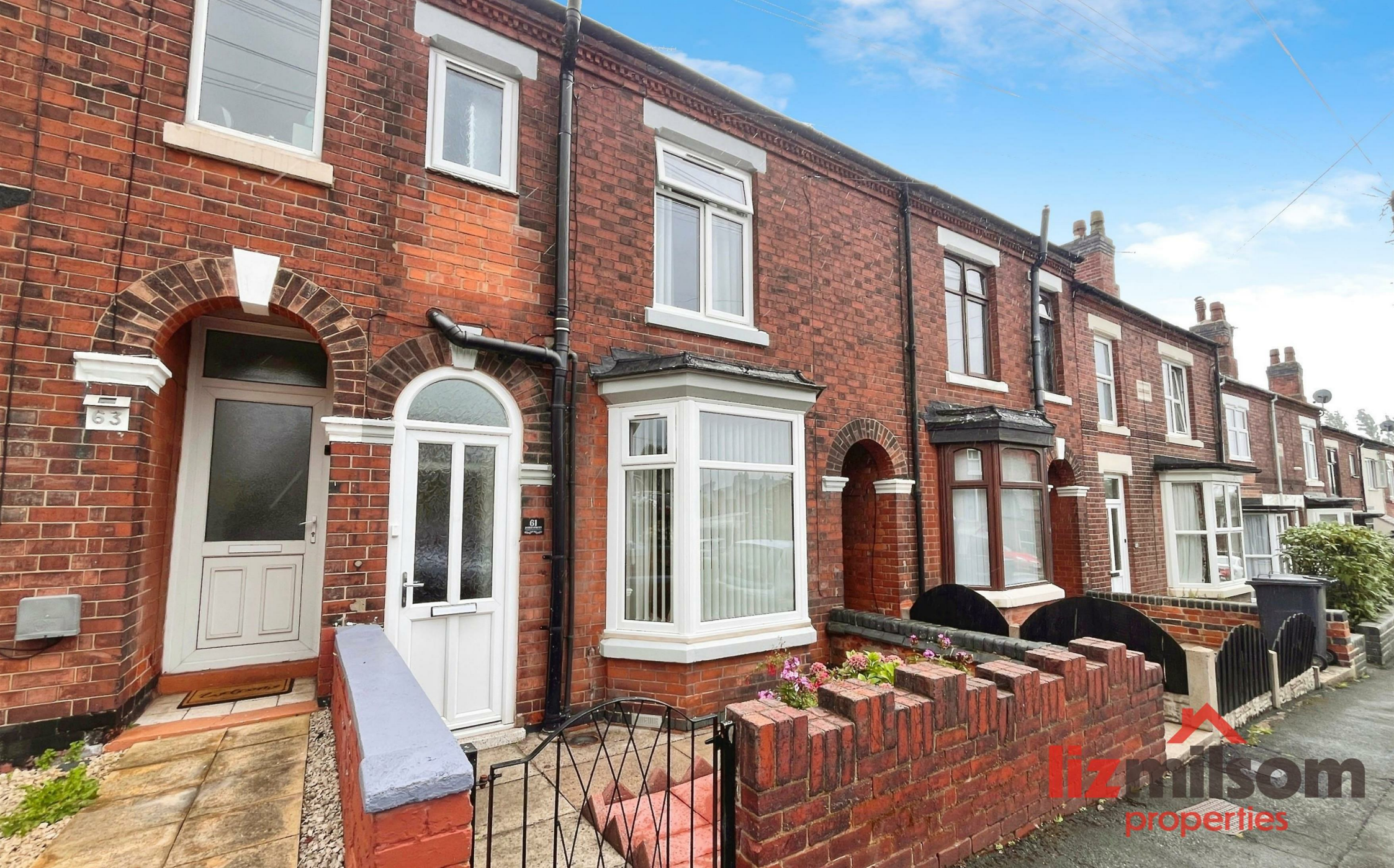
61 James Street Swadlincote, DE11 7NE Guide price £185,000